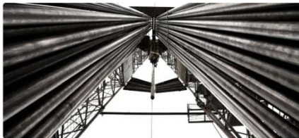
Naval and Offshore